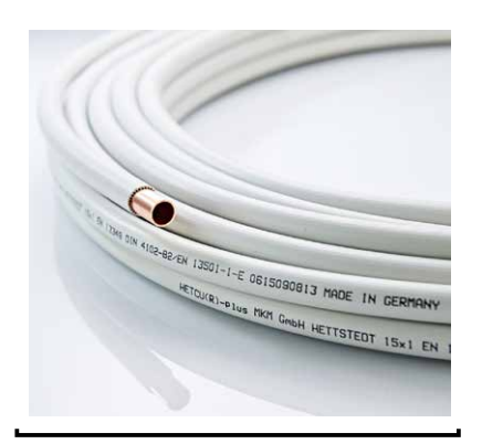
HETCU<sup>®</sup>-plus for special applications

The value of a demonstrably residue-free material like copper cannot be overstated, especially in the sensitive field of drinking water supply. Certificates issued by DVGW CERT GMBH – an accredited testing institution for products in the water and power supply industry – and by Lloyd's Register Quality Assurance GmbH confirm our production procedures as well as our first-rate product quality.